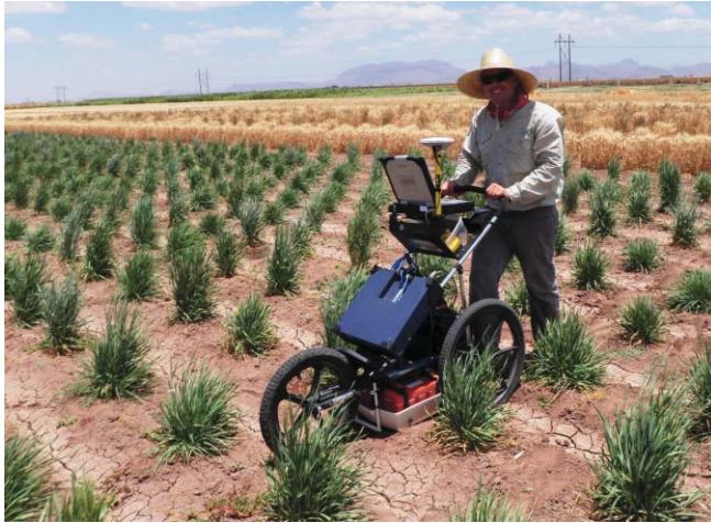
Figure 1. Ground-penetrating radar equipment in use.

equipment is best-suited to areas free from rocks and litter, where it can be moved across the surface with few gaps between the antenna and soil.